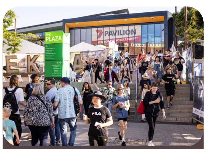
Benefit from our multi-million-dollar promotional campaign encouraging Queenslanders to attend Ekka.