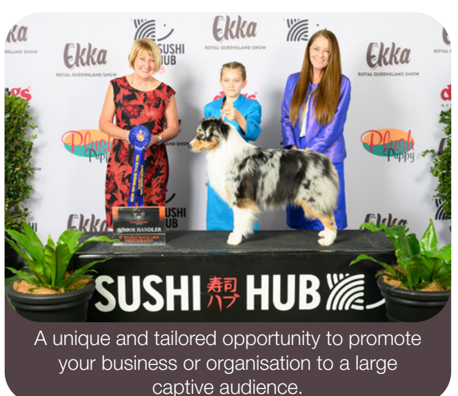
Connect with the community through engaging and educational activations.

·3 / Sponsorship Prospectus / Queensland's Largest Event