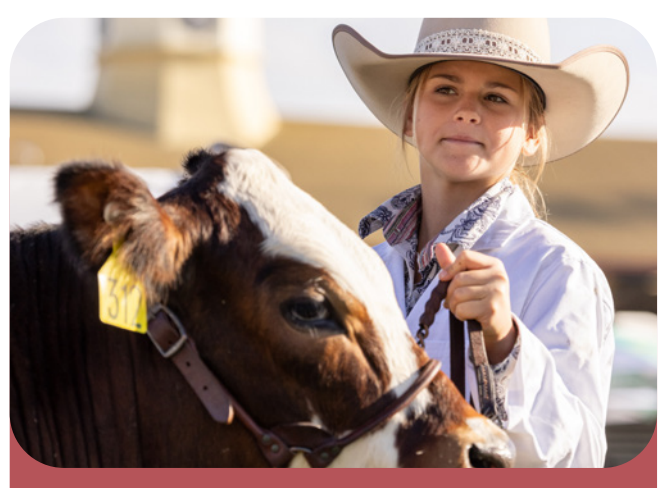
Show your support for Queensland agriculture & farmers as we bring the country to the city.